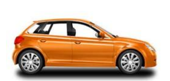
Car (first years)