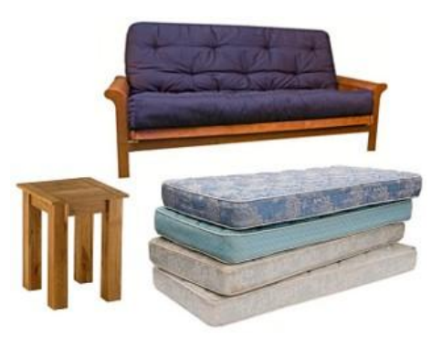
Furniture (first years)