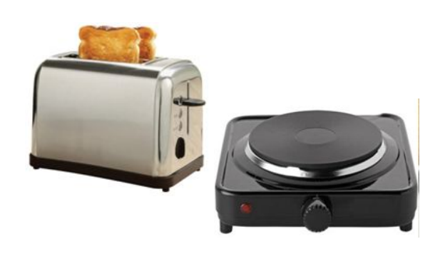
Open element Appliances