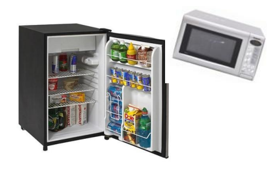
Microwave or fridges