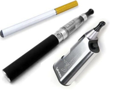
E-cigs and Vapes