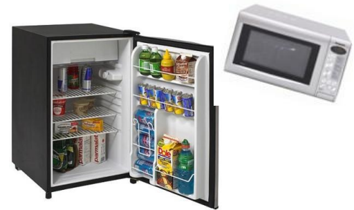
Microwave or fridges