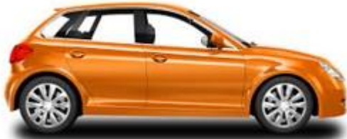
Car (first years)