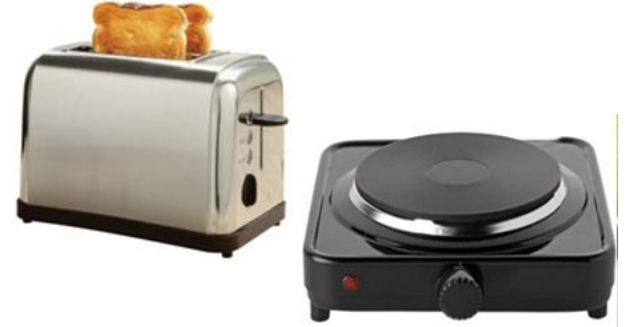
Open element Appliances