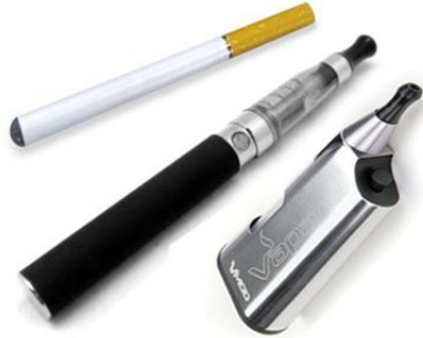
E-cigs and Vapes