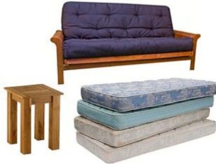
Furniture (first years)